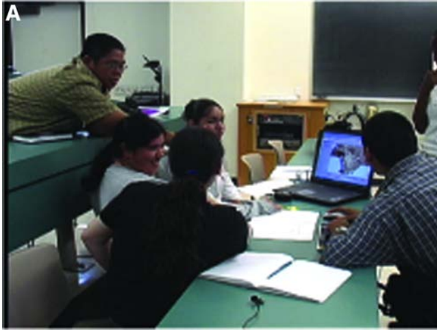
Figure 4 Creating and Analyzing Computer-Generated Maps