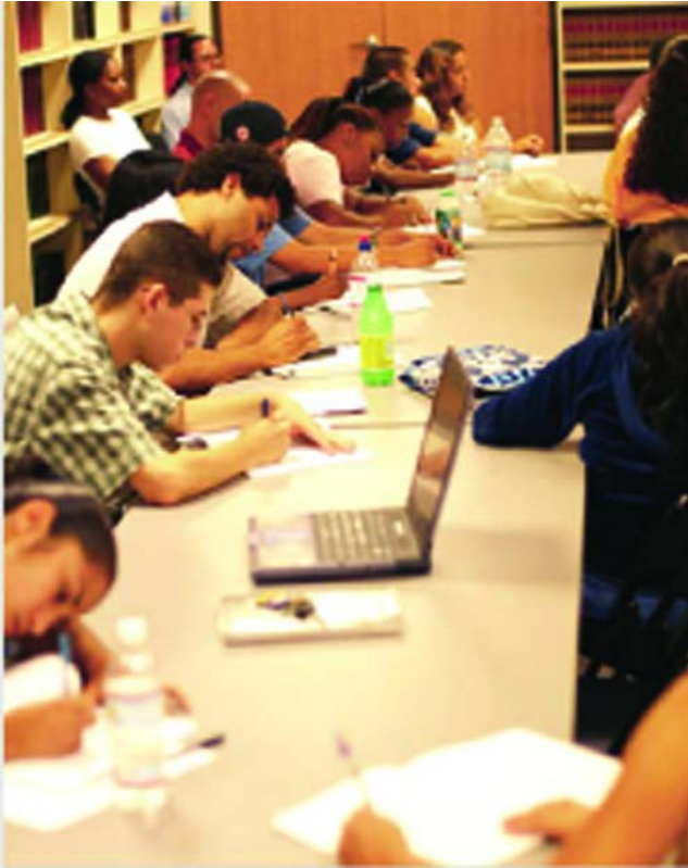
Figure 1 Taking Notes in Large Group Seminar