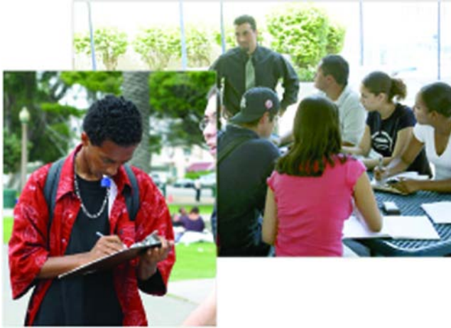
Figure 2 Gathering Data in Schools and Communities