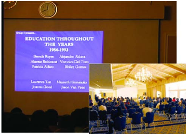
Figure 3 Presenting Research Findings